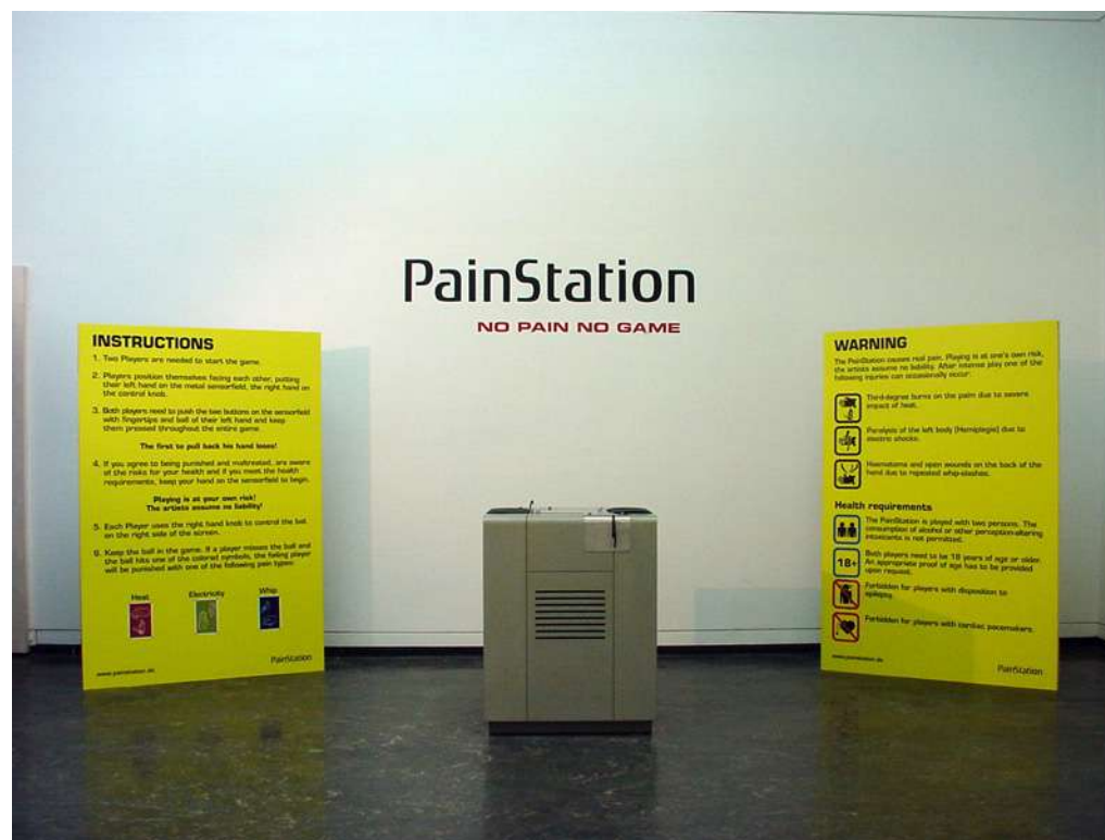
Example Installation Setup: Detox Exhibition, Oslo 2005 by Peter Andersson (The huge warning signs are NOT shipped with the machine!)